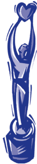
GLAD received the 2004 Greater Boston Business Council's Founders Award